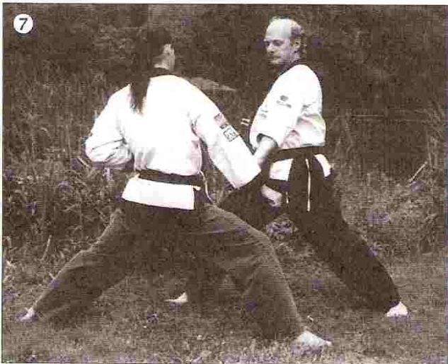
Block with left.