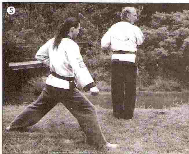
Ready turn to back kick.