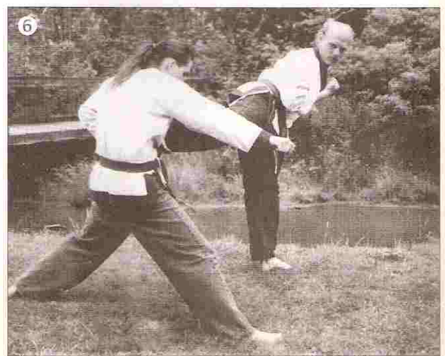
Back kick to solar plexus.