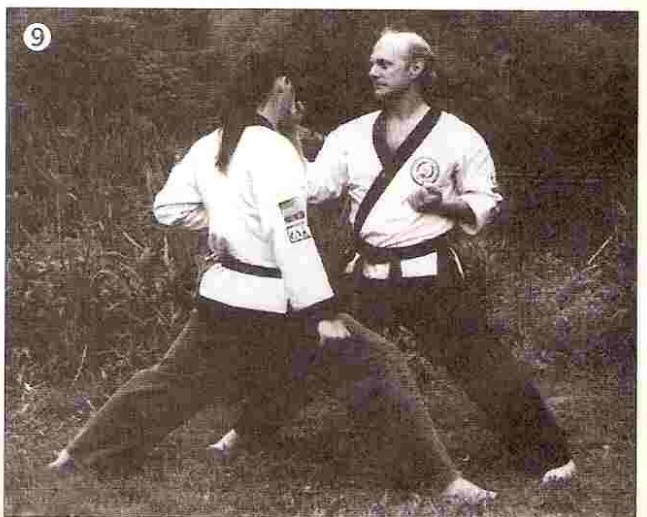
Tiger claw strike.

The responsibility to grow and mature begins the moment a new Tang Soo Do