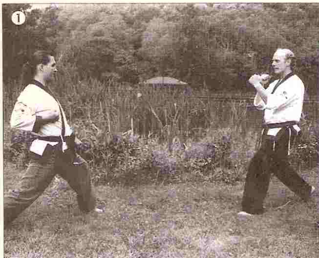
1 Ready position.