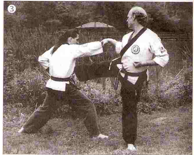
Front round kick.