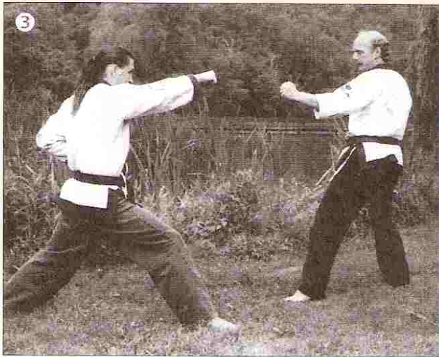
Return leg from front kick.