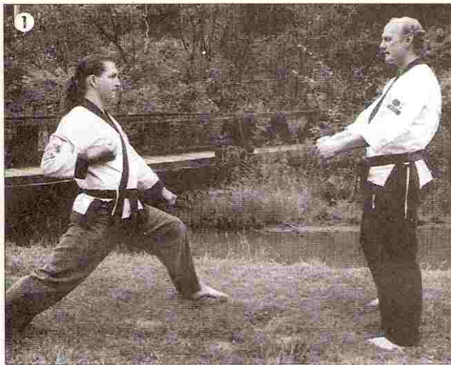
Defense against a punch. Ready position.