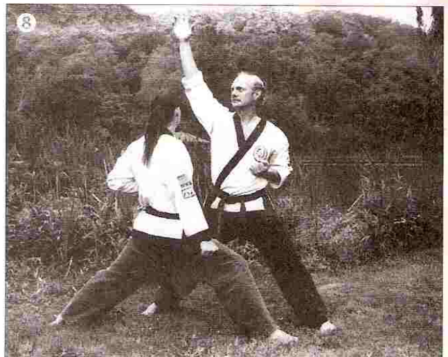
Arm up for tiger claw.