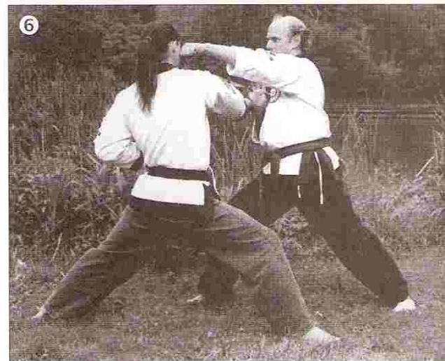
6 Punch with left hand.

and practices of Grandmaster Hwang Kee who had been teaching a karate style called Soo Bahk Do. From Soo Bahk Do, Hwang Kee established the modern Tang Soo Do style under his Moo Duk Kwan Federation. In effect, Tang Soo Do separated itself from the popular practices of sport-oriented tae kwon do .