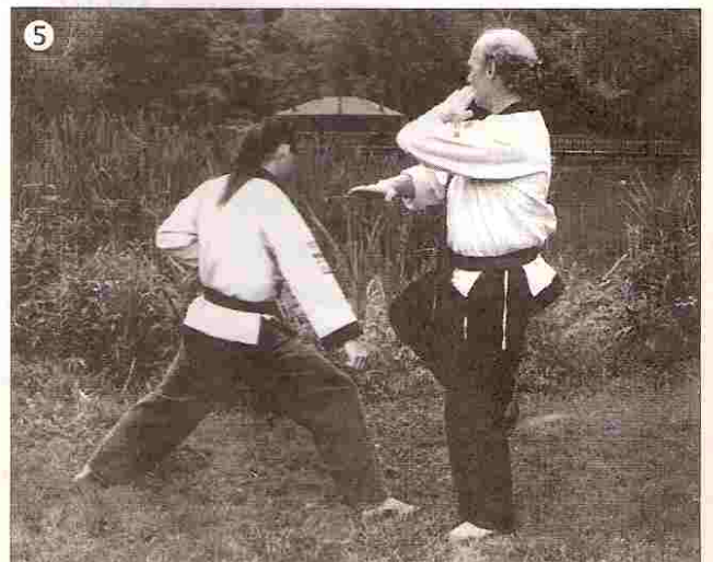
Ready for slap sweep.