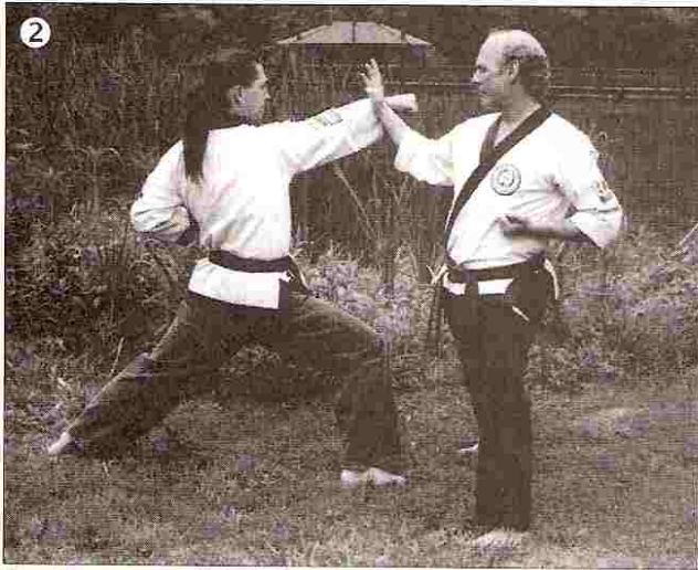
Outside step around block.