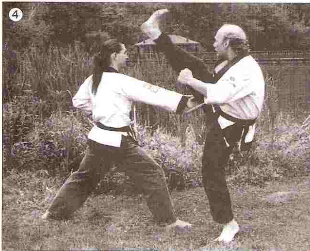
Inside outside hook kick.