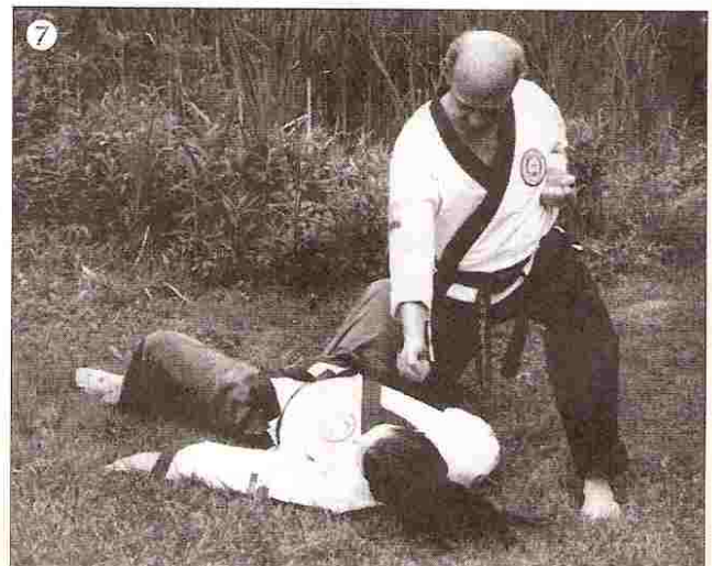
Reverse punch finish.