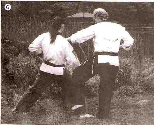
Left hand shoulder slap, left foot sweep to ground.