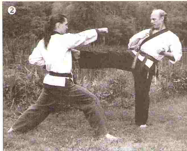
2 Front kick under attack.