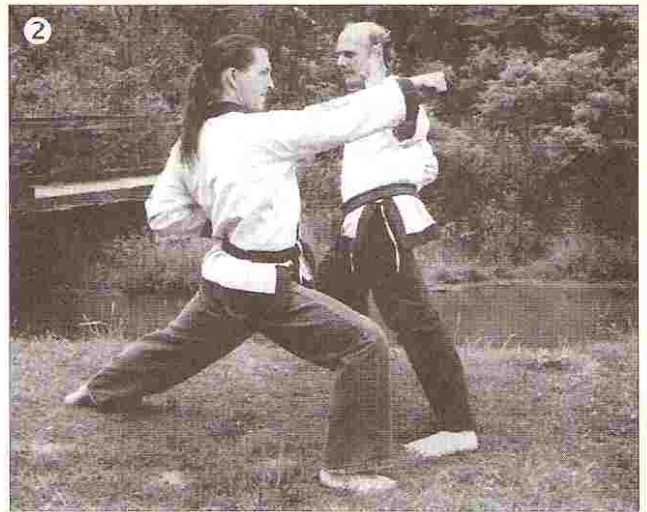
Step inside outside block.