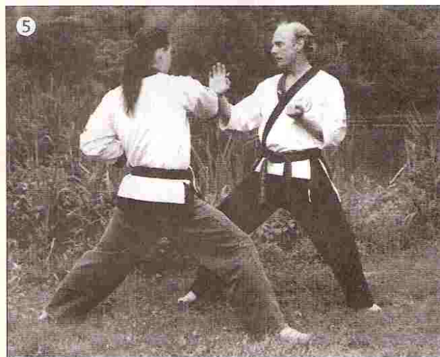
5 Block with right hand.