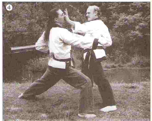
Pivot left hand palm strike.