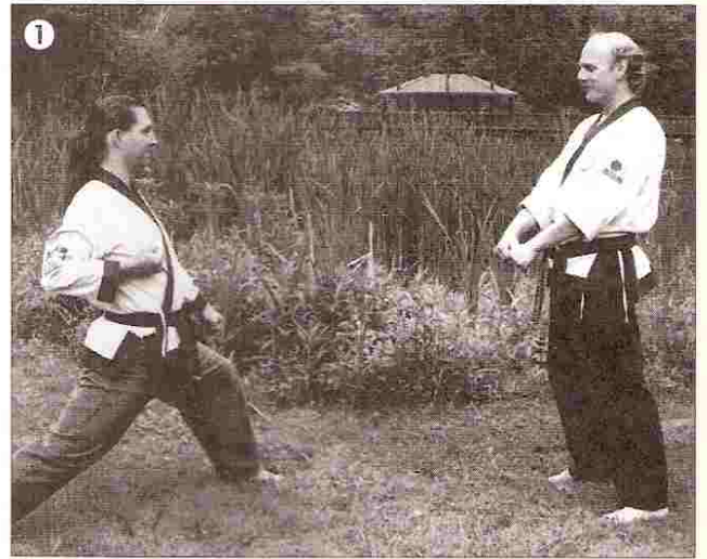
A representative Tang Soo Do sequence, showing the style's fighting spirit. Ready position.

As with all martial arts, the basis of Tang Soo Do likely started with early ancestors who defended themselves using only bare hands and feet. However, its known origination came in 1945 from the experience