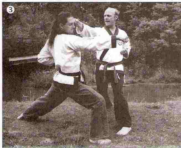
Pivot right hand punch.