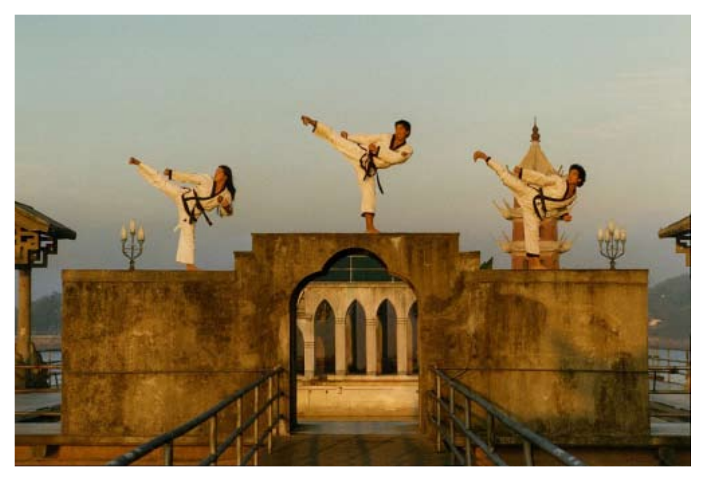
The Mott siblings in China in 1986.